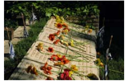
Flags and flowers adorn graves in Har Herzl Military Cemetery on Memorial Day.