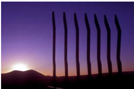
The Etzel Memorial in the cemetery in Safed, marking the burial site of seven Jewish fighters hanged by the British in 1947.